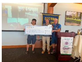
Great meeting and breakfast!!