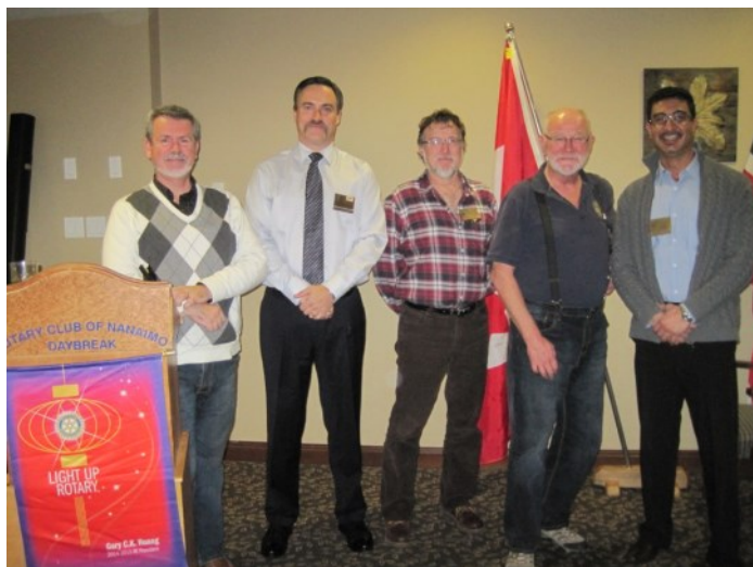
...Because it’s Movember, those with staches posed for a Rogues’ Gallery photo.

Don then gloated that running the 1500 meters in less than 4 minutes is no big deal cuz everytime he runs its always for less than 4 minutes. Really?????????